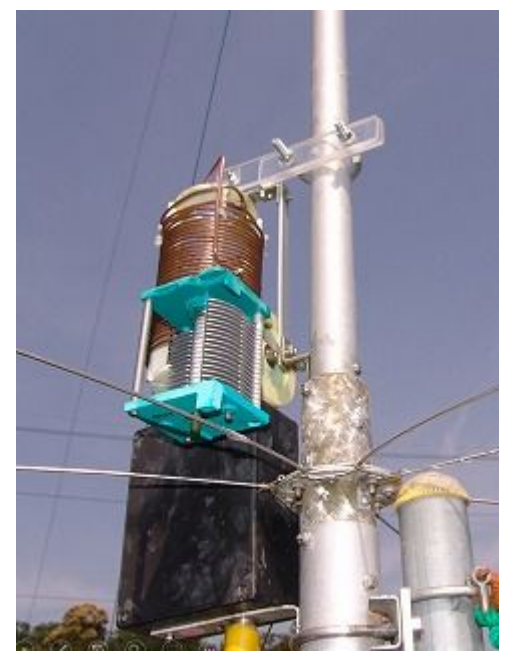
Fig. 3 R9 with a 160 m add-on.

I am not very much satisfied with the minimum SWR 2:1 obtained without the tuner. One of the reasons of 2:1 may be related to the specification of the matching box of R9 as shown in Fig. 2B. In the box, two toroidal cores are contained: One is for a choke balun and the other is for an autotransformer from 50 ohm to 240 ohm. To obtain better matching, necessary is an additional transformer, or further research on the LC circuit and configuration.