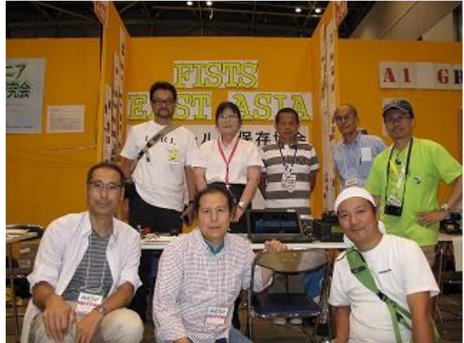
Ham fair in 2017

Volunteers from FISTS EAST ASIA members will open a booth for exhibitions and demonstrating Morse communications. We are waiting for your visit and looking forward to meeting FISTS members from all over the world.