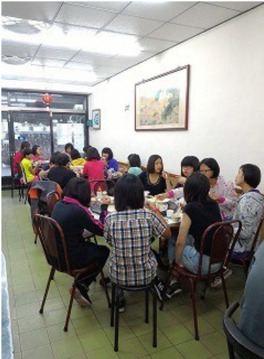
A picture of some of the girls from Onesiphorus enjoying a meal at the NanBei on a Saturday afternoon.

Every Saturday afternoon for around forty years a group of kids from the children's home enjoy a meal out at the 南北餃子館, or the NanBei (South-North) Dumpling House. The family that runs this establishment has always been very generous to the children's home and concerned about the children in our care. Each Saturday they reserve a few tables and expect the bus to arrive with enough kids to fill the downstairs tables for an early dinner of pork dumplings, hot and sour soup, and a few other dishes. My wife and I used to accompany a group of kids each Saturday, and I fell in love with pork dumplings. When I was a young man and didn't have to worry about putting on weight, I could easily consume a few dozen of them without a second thought. Each person concocts his own mix of sauces to dip the dumplings in before placing them in his mouth; I prefer straight soy sauce and lots of black pepper, but many also add sesame oil, chili sauce, and lots of garlic.