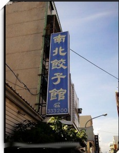
The sign for the NanBei establishment outside the entrance.