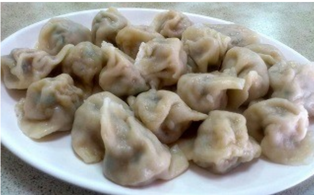
A plate of NanBei pork dumplings