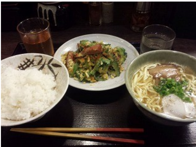
Shibuya goya teishoku

Maybe one day I can travel to Okinawa... but I am afraid that I might like the food so much that I will not leave! For FISTS members who live outside JA and have a chance to travel to JA please try Okinawan cuisine. Japan is not only sushi and ramen!