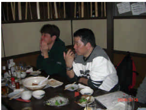
L to R: Aki/JJ1TTG and Aki/JP1BJB#15039