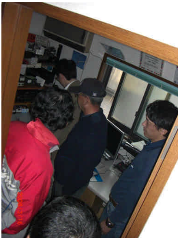
Nao is inspecting my radio if it is usable for FEA CW NET control.