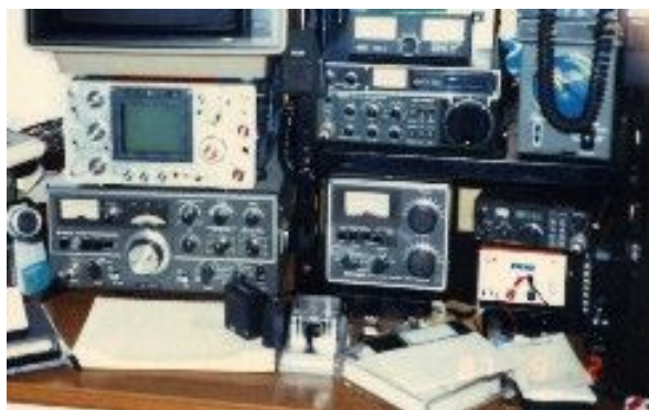
My Shack in 1987

My ham life started when I was eleven in 1979. An English teacher at my middle school who was a ham and enjoying chatting with people on the air showed me how interesting the hobby was. I spent a couple of months to pass the exam and got a ticket with JM1JOT. I don't remember who the very first station I worked was, but I do remember that I was so nervous that my voice was shaking and couldn't speak normally. I chose 6m to start. My first radio was an RJX-610. The 6m band was pretty popular for teenage hams and it was easy to make friends with. I got on the air after school every day, so it took less than a couple of weeks before I made my first eye-ball QSO. I have met a lot of interesting hams in the first several years of my ham life and quite a few are still keeping in touch. The RJX-610 had been my main radio until it was replaced with an IC-551 in 1982.