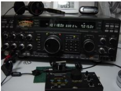
My shack in 2006