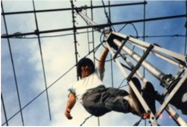
My ANT in 1987

My ham radio activity got to stop after I passed my first class license. Well, I ran into a new hobby, Rally or a kind of car racing. For my new hobby, I ended up selling most of my equipment except a small hand-held and a mobile radio. I won't tell you about that hobby here, but it was so exciting and worth selling the ham stuff. My blank period lasted about ten years until my wife and I moved over to the U.S. in 2000. For the first two years in the new country, I was pretty busy establishing my new life and catching up with some new responsibilities as a software engineer at my new employer. As I was getting settled in, I thought I wanted to have something fun... something fun like ham radio that I was absorbed in before.... Yes! That's it! Then I got back on the air with AE6DE (I took a vanity call K6KF later) from the SF bay area and I joined FISTS. This time my focus was definitely on CW. Constantly working some stations a week helped raise my CW speed little by little. That was so interesting. Plus I finally obtained my DXCC and WAS.