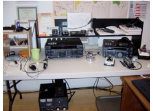
K6KF San Jose

After living in California for five years, I decided to leave the U.S. permanently for a new job in Japan. The new location is Hokkaido, the north island of Japan, where I dreamed of living in before. It's been four months now since I came back to this country. Here in my new apartment, I set up a small HF station with a 3 meter rod plus an auto antenna tuner. This set seems working so better than I expected that I can work NAs and OCs occasionally even on the 40m band.