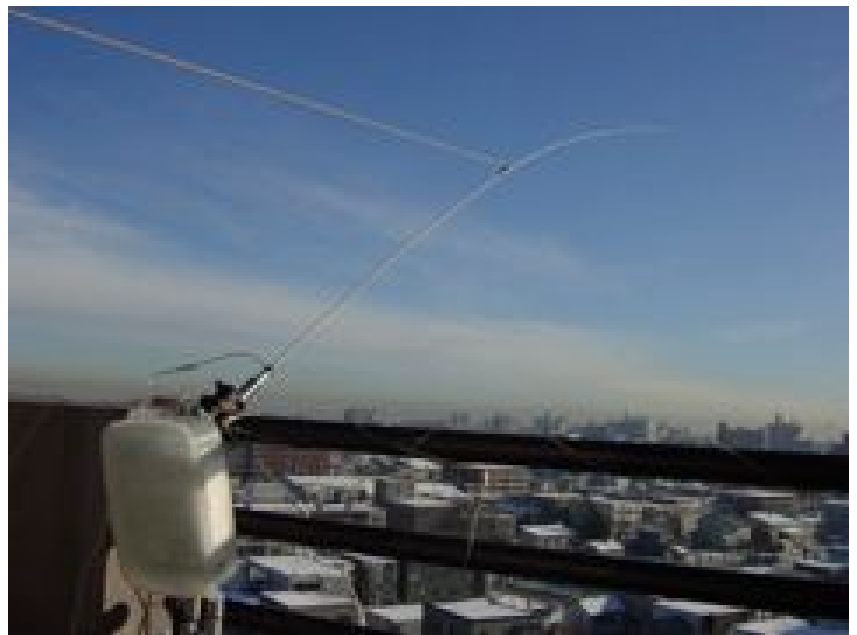
My ANT in 2006